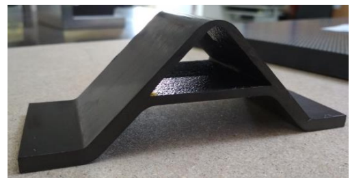
Hot pressing Thermoplastic part produced with Cavuscore mandrel (process data 280°C / 45bar)