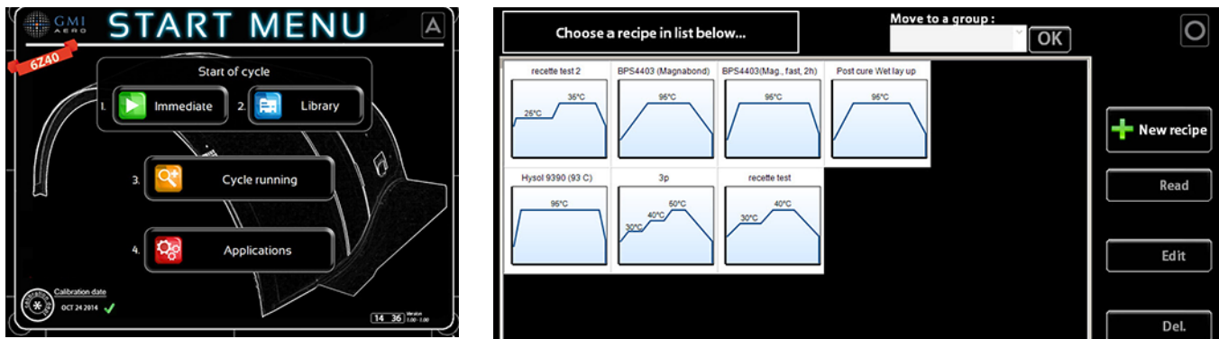
Examples of programming screens