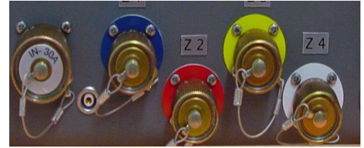
4 Power out connections