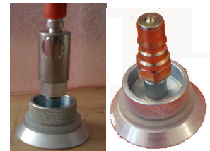
Left model 2 (France ) Right model 1