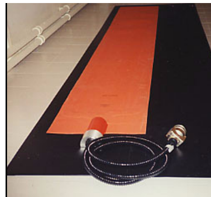
Left: a radome with 4 large areas; Right: A long heating blanket designed with 4 zones for helicopter blade repair